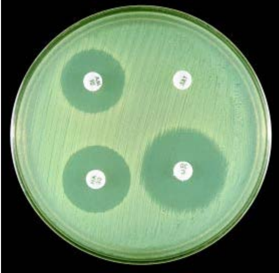
Figure 2. Results of the disk diffusion assay. This Shigella isolate is resistant to trimethoprim-sulfamethoxazole and is growing up to the disk (SXT), the zone of which is recorded as 6 mm.

undersurface of the plate without opening the lid. The zones of growth inhibition will be compared with the zone-size interpretative table and recorded as susceptible, intermediate, or resistant to each drug tested according to CLSI guidelines (see Appendix).