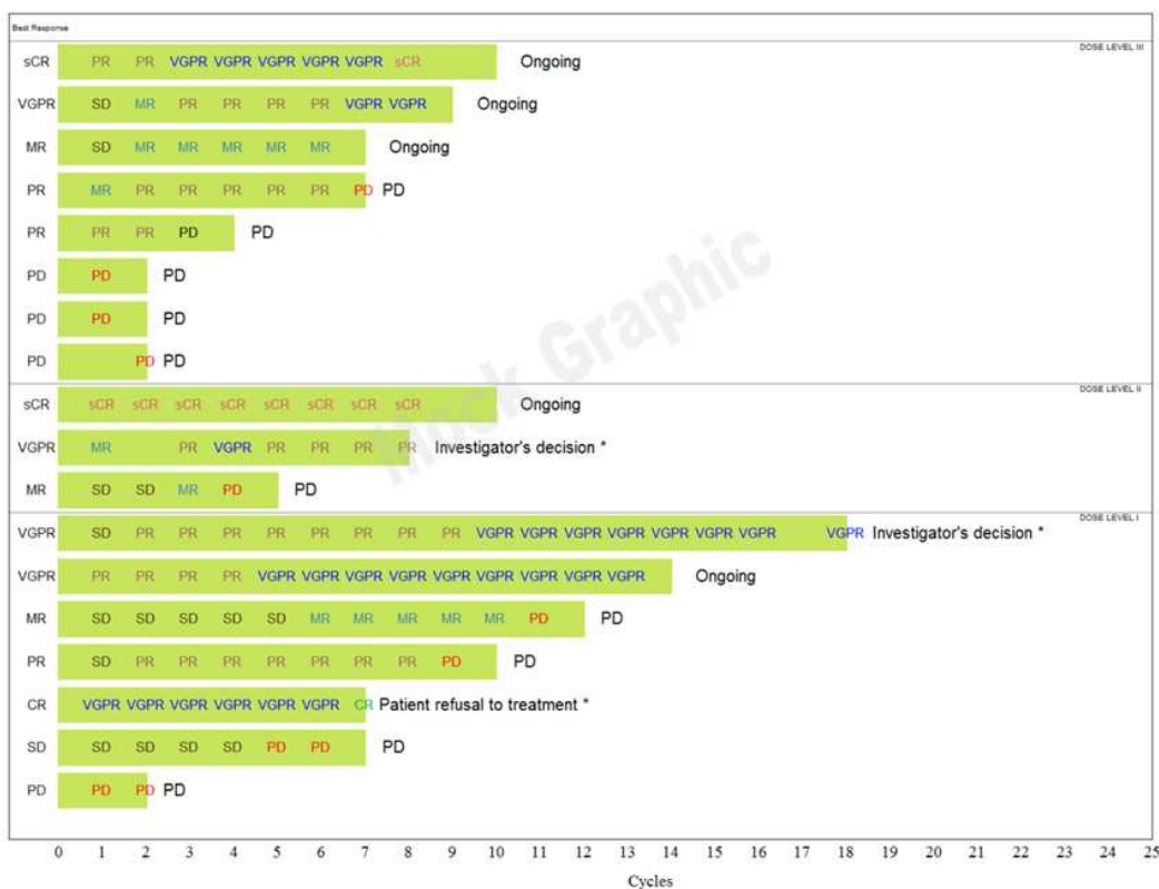
Figure 11.2.5.6 . Response to Treatment per Cycle in All Patients Evaluable for Efficacy

List of covariates will be provided by the medical responsible