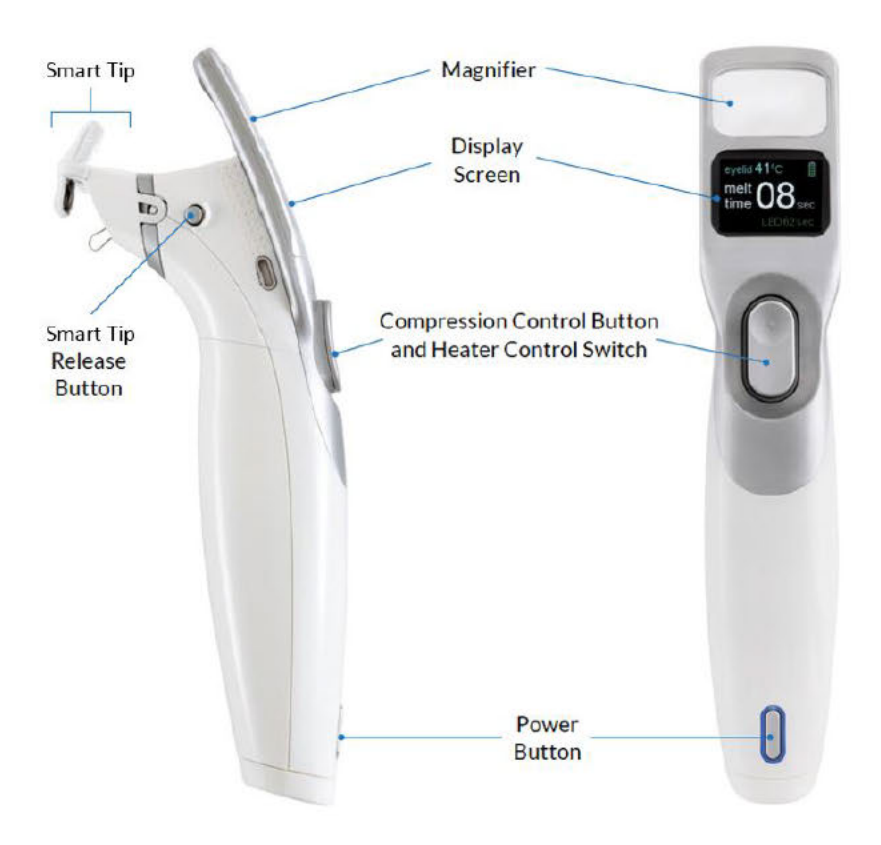
Figure 2: iLux® device with Smart Tip