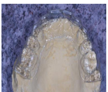
Normal VFR retainer