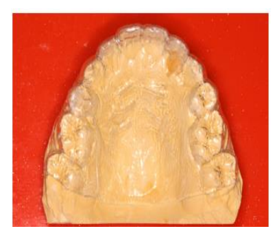
Modified VFR (palatal