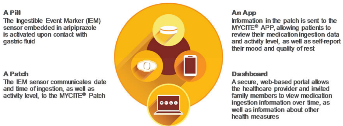
Figure 1-1 Abilify MyCite Components

The components of Abilify MyCite are shown in Figure 1-1 and an overview of the Abilify MyCite system is shown in Table 1-1.