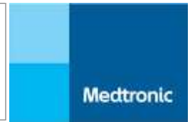
Table 10: Investigator reports applicable for all geographies per Medtronic requirements