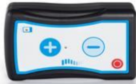
Figure 4. Trial Stimulator

Patient Remote (Figure 5): The Patient Remote is a handheld battery operated unit able to communicate via RF with the IPG/Trial Stimulator. It is used by the subject to select the stimulation program to be applied, to activate and deactivate the IPG/Trial Stimulator and change stimulation amplitude.