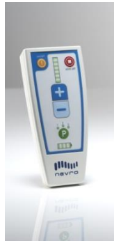
Figure 5. Patient Remote

Patient Remote (Figure 5): The Patient Remote is a handheld battery operated unit able to communicate via RF with the IPG/Trial Stimulator. It is used by the subject to select the stimulation program to be applied, to activate and deactivate the IPG/Trial Stimulator and change stimulation amplitude.