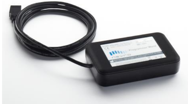
Figure 7. Programmer Wand

Programmer Wand (Figure 7): The Programmer Wand is the Programmer interface that allows the communication with an IPG or Trial Stimulator. The Programmer Wand connects to the Programmer laptop through a USB port and communicates via RF with the IPG or Trial Stimulator.