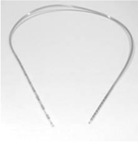
Figure 8. Percutaneous Lead

The Lead Extension is intended to be used when the implant site for the IPG is located too far from the stimulation site to directly connect to the Percutaneous Lead. The design, material and construction methods on the proximal end and lead body of the Lead Extension are identical to the Percutaneous Lead. The distal end of the Lead Extension is designed to accept the proximal end of the Percutaneous Lead. The Lead Extension is the same size and diameter as the Percutaneous Lead except at the distal end where the Extension has a larger diameter to accept the proximal portion of the Percutaneous Lead.