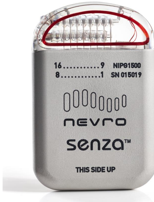
Figure 2. Implantable Pulse Generator

IPG/Trial Stimulator interface with other Senza components (Figure 3): A bi-directional communication link exists between the IPG and the Charger. Similar to other commercial SCS systems, the Charger uses transcutaneous RF energy transmission in order to recharge the IPG battery. Energy is transmitted from the Charger to the IPG using a frequency between 410 kHz and 485 kHz. The IPG is capable of communicating with the Charger to control the recharging function.