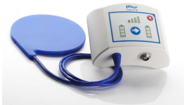
Figure 6. Charger

Charger (Figure 6): This Charger is used by the subject to transcutaneously charge the IPG battery. It is a portable device powered by a rechargeable battery and can be held in one hand.