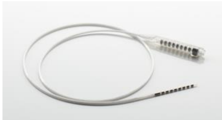
Figure 9. Lead Extension

The construction of the Lead Extension is identical along its length to the Percutaneous Lead.