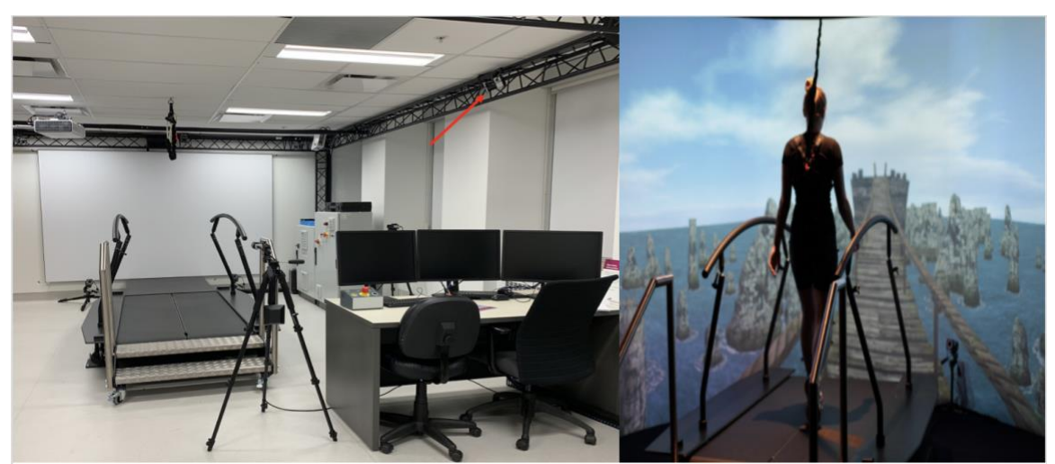
Figure 3: Treadmill training with the virtual reality system. A) The gait lab, featuring the SBTM (Grail systems<sup>®</sup>, by Motek, Netherlands), virtual reality screen, and desk where the study coordinator will monitor the experiment. The arrow points to one 6 infrared cameras (Vicon Motion Systems Ltd, V5, UK; 420 Hz sampling frequency) which constitute the motion capture system B) Simulation of a subject walking on the SBTM, while attached to a harness to prevent falls, adapted from the MOTEK website.

The over-ground walking speed will be analyzed using a 6-metre walkway and dedicated movement analysis software (Zeno walkway<sup>®</sup> by Protokinetics, USA). Video assessment of gait will be captured with 2 video cameras.