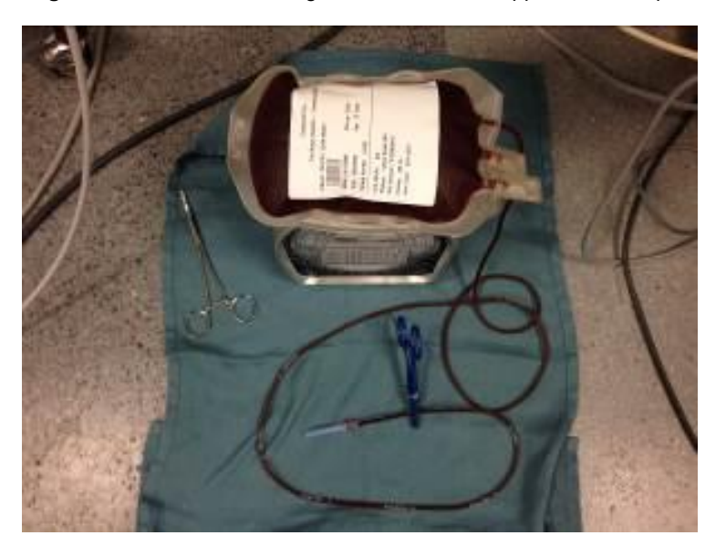
Figure 2. Filled collection bag on scale, needle capped and clamped